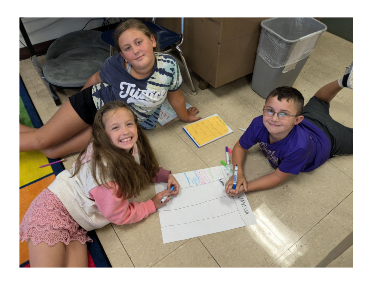
Holland Patent Elementary