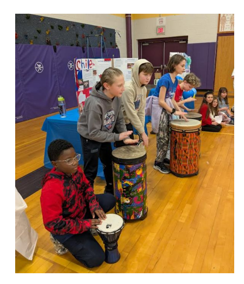
District logo here